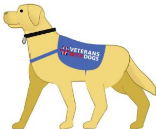
Veterans With Dogs