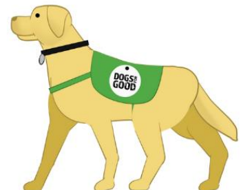
Dogs For Good