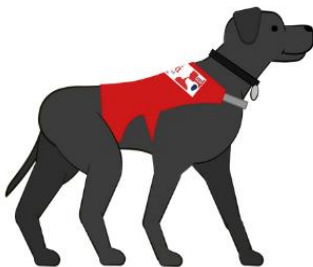
Service Dogs UK