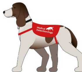
Medical Detection Dogs